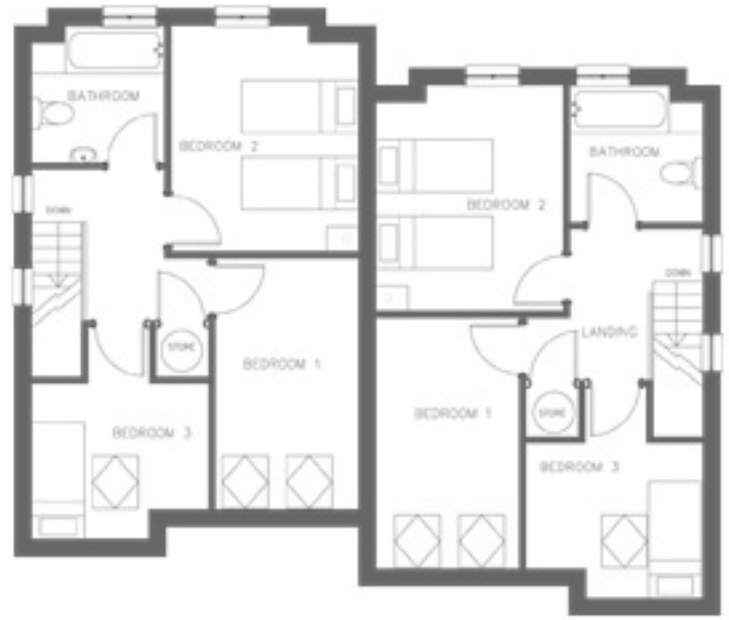
First Floor Plot 3