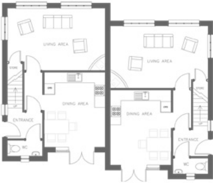
Ground Floor Plot 3